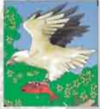
OL EGEL I MEKIM HAUS BLONG OL LONG KARIM PIKININI LONG HAN DIWAI BLONG MANGORO NA I SAVE KAIKAI OL PIS KLOSTU LONG MANGORO.