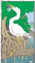
OL MANGORO I NABAWAN HAP BILONG OL KANAI NA OL ARAPELA PISIN LONG PAINIM KAIKAI.