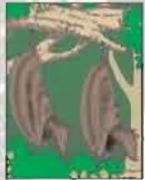
OL MANGORO DIWAI I NIDIM OL BILAK-BOKIS NA OL BINATANG LONG MARITIM OL FLAWA BLONG OL.