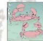
OL LIP IDAI NA OL I PUDAUN IGO LONG WARA NA I KAMAP OLSEM KAIKAI BILONG OL KUKA, KINDAM NA SELPIS.